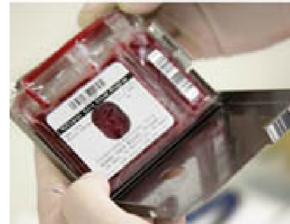
Pall's advanced freezing bag design divides the sample into two compartments, enabling a 4:1 division of sample for ex vivo cell expansion.

Cord blood stem cells have been effectively used in the treatment of more than 70 malignant and non-malignant diseases, including sickle cell, leukemia, non-Hodgkin's lymphoma, other forms of cancer, life-threatening anemias, and autoimmune diseases. As a key supplier to the cord blood banking industry, Pall provides a full range of bag sets that are used to prepare the cord blood stem cells for treatment.